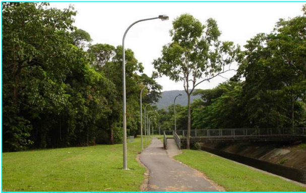
Path beside Chinaman Creek