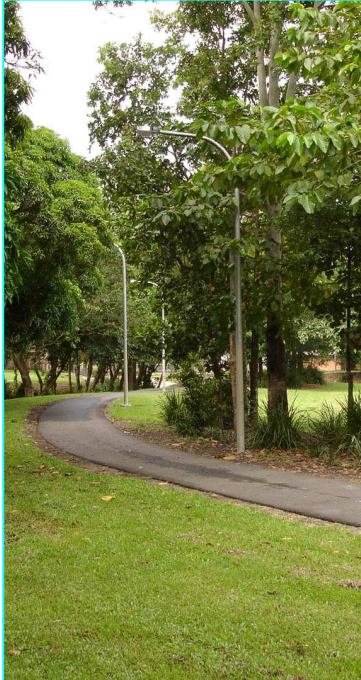
Path beside Chinaman Creek