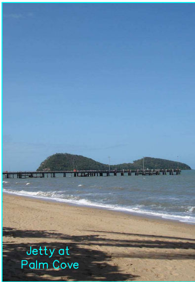
Jetty at Palm Cove

For the return trip, head back down the Esplanade to re-join Argentea boardwalk. Follow the path right to the end of the bush and past the playground to join Linden St. Take the cycle path alongside the highway and turn left onto Poolwood Rd. Take a right at Jules St and use the path to join Periwinkle Ave which takes you back to Coastwatcher Park at Trinity Beach.