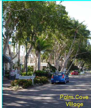
Palm Cove Village