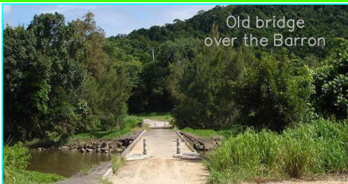
Old bridge over the Barron