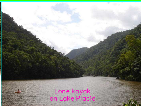
Lone kayak on Lake Placid