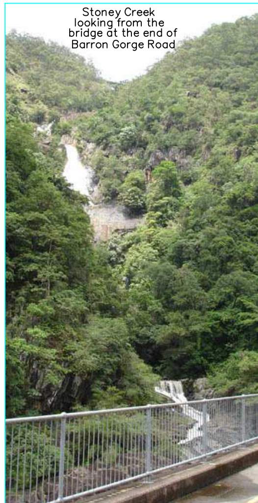
Stoney Creek looking from the bridge at the end of Barron Gorge Road